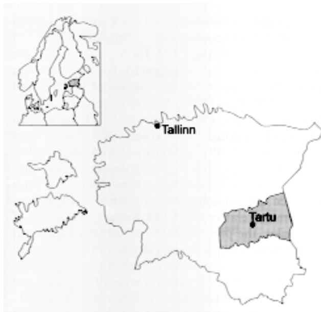
Figure 1. Geographic location of the study population in South Estonia. The small map shows Nordic and Baltic countries, the detailed map shows area of the investigation (Tartu district).

Estonia has a developed medical care and registration system. Health care is universally available and uniformly delivered. All patients are registered by any family doctor, and those with suspected chronic neurological diseases are referred to a neurologist. Tartu is a suitable place for epidemiological studies as the Department of Neurology and Neurosurgery of Tartu University, the only teaching neurological hospital in Estonia, is the neurological centre for the region.